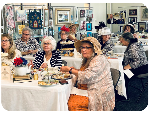
The Friends held a traditional Englishstyle coronation tea fundraiser this spring, their first event of this kind

We invite you to join the Friends of Ritter Public Library. We welcome your talents, ideas and desire to support the jewel of