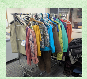
Coats, gloves, and more are offered during the cold months

of two refrigerators, a freezer, and a pantry stocked with an assortment of food staples.