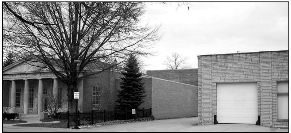
This view of the east side of the library shows where possible expansion could take place if the old car dealership next door were razed.

at our financial resources and the needs of the community to try to come together on a vision for the future," said Jim Liljegren, president of the board.