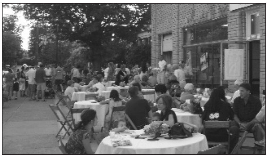
Hundreds of residents gathered for one last blast in the annex last month, to celebrate Ritter's 50th anniversary on Liberty Avenue.

5680 Liberty Ave. 440-967-3798 Vermilion, OH 44089 Fax: 440-967-5482 Dial-A-Story: 440-967-3799