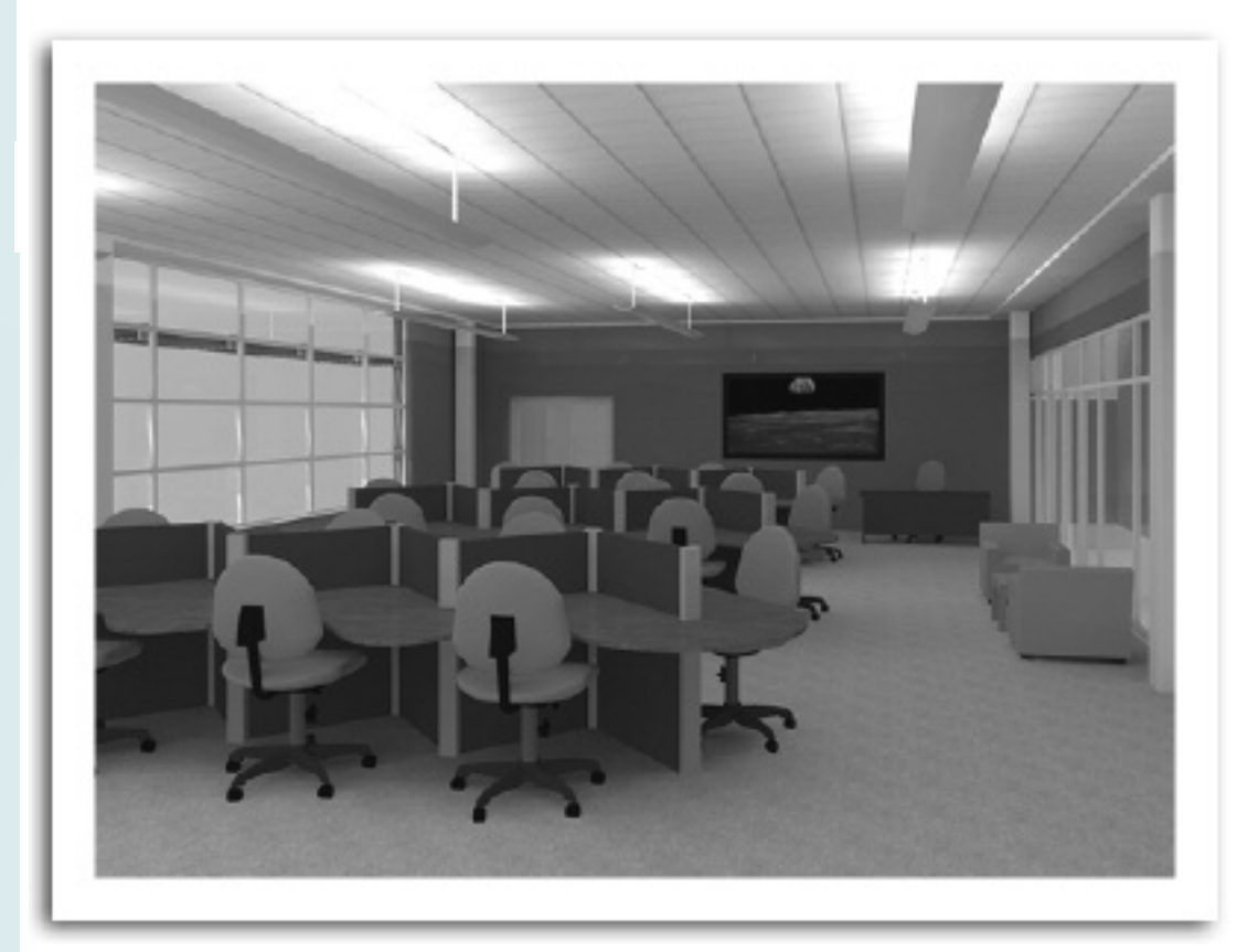
This possible design shows how the new computer room could be configured. It will face Liberty Avenue and will include more than 20 Internet-access computers.

Computer-generated pictures show design concepts