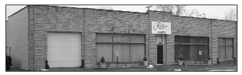
Material from the demolition, such as concrete and steel, will be recycled.

Once all the paperwork and permits are in place, Rini said, physically tearing down the building should only take about a week.