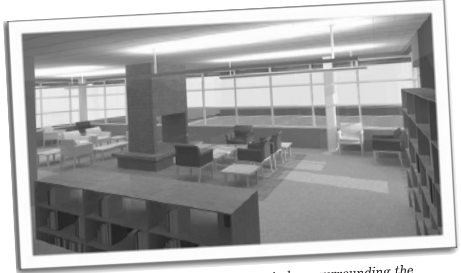
This computer-generated design shows windows surrounding the upstairs reading room for adults, which will look out over a green roof. The centerpiece will be a cozy fireplace.