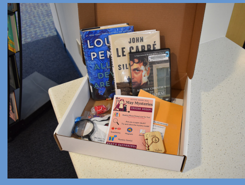
A look at one of May's mystery-themed

Thanks to the Friends of Ritter Public Library, we are once again offering subscription book boxes for all ages throughout the summer season. Each month has a new themed box filled with a selection of books and fun extras. Return the books, but keep the extras! Spaces fill up fast, so be sure to register in the first week of the month for the following month's box. To register, call the library once registration opens or like us on Facebook, where the link to register online will be posted. July registration will open June 1st, and August registration will open July 1st and will remain open until spaces fill.